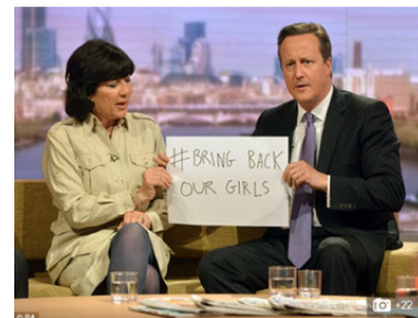
Fig. 5.

The pictures above show high profile personality, leading their support for the worldwide campaign for the safe return of the abducted school girls, with a placard signs reading “Bring Back our Girls” as a form of solidarity which reflects a collective identifications and emotion, for resources mobilization (Nicole, Alice & Simon, 2013) regarding the global outrage of the “BBOG” campaign. The [Fig. 3] picture shows Malala Yousafzai a seventeen year old female education activist from Pakistan, her eyes is heavy with tears, and her face expresses concern for the abducted girls. Her mode of dressing shows she is a Muslim. Though, report revealed that, over 90% of the abducted girls belong to the Christian religion (Owojaiye in Stoyan, 2014). This female education activist set apart her religion to support the release of the girls. A meaningful interpretation of this is that, regardless of religious beliefs and affinities, humanity must be protected and human rights must be observed. The participation of the female education activist is normative and likened to that of ‘moral’ and not religious point of view. The gospel of moral and human resources, based on the resource mobilization theory includes integrity, solidarity support, sympathetic support, celebrity, leadership, experiences, labor and other resources, that make it possible, for social mobilization movements (Elwards & McCarthy, 2004; Elwards & Patrick, 2013).