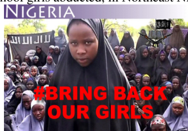
Fig. 1.

but a few intervened in the ongoing “BBOG” global campaign (Sonya, 2014 and Hugo, 2015). The picture below shows the Chibok secondary school girls abducted, in Northeast Nigeria.