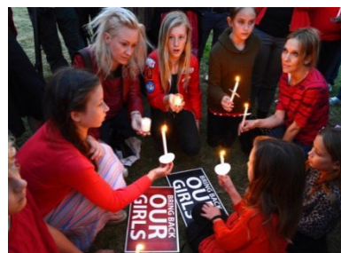
Fig. 11.

The pictures above show the social mobilization campaign for “BBOG” in solidarity for the abducted school girls, in the northeast Nigeria. [Fig. 9] picture shows the European Student Union, added their voice to the global campaign, holding up different alphabet that made up the phrase reading “Bring Back Our Girls”. These are students from different parts of European nations, and probably with different religious, gender and cultural background, who creatively display and demonstrate their support for the release of the abducted school girls. In the foreground are five students holding up signs of the alphabet “Girls” and immediately behind them are all students different alphabet that make up “Bring Back Our”, and at the background are the rest of the students standing in agreement behind those who hold the placard.