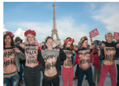
Fig. 8.

The pictures above show the mass mobilization across countries in campaign for “BBOG” in solidarity and concerned for the safe return of the abducted school girls by Boko Haram sect, in the northeast Nigeria. [Fig. 6] picture shows, a mass social mobilization rally by a group of women in red color material expresses, the consciousness of the danger the abducted girls are in, the touch of black, which can be seen scanty among the women with their emotional state of mind, as it suggest mourning among the Africans, especially Nigerians. The widely opened mouth suggests the women were echoing the same thing while their facial expression projected, anger, hopelessness, sadness, and disappointment. The appearance of the women, indicate they are mothers, and grandmothers. The cause of their campaign has overruled their religious inclinations and ethnic background. The involvement of women’s in a clarion call for social mobilization movement, is most time employed, as an instrument for change, to bring cessation of conflict and in peace building efforts, to address the issues of social injustices among others (Lucy, 2011).