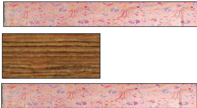
Figure 1. The picture of the cloth-rag and the table of Worksheet 1

The individual worksheet (worksheet 1) will asked the students to imagine whether a cloth-rag which shown in the paper could cover the table which also shown in the paper perfectly or not. The cloth-rag is twice longer but a half wider than the table. This time, the students still use their perceptual justification. Later on in Worksheet 2, the students were divided into group consisted of 4-5 students to demonstrate their perception. The students were asked to prove their answer by giving the model of the cloth-rag and the Barbie's table. There will also some questions that ask the students to choose which one is bigger the cloth-rag or the table. They are expected to get the conclusion of the recomposing shape and reversibility in Worksheet 2. The following picture is shown the cloth-rag and the table which is shown to the students in Worksheet 1.