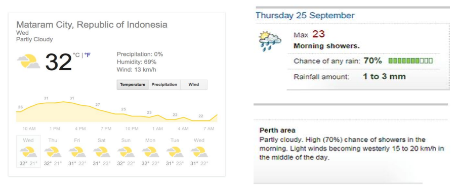
Figure 1 . An example of the use of probability ideas in real-life.

With respect to real-life application, students could be introduced to information about the weather that predicts the likelihood of rain in a given day. Data could be gathered from the Internet as illustrated in Figure 1.