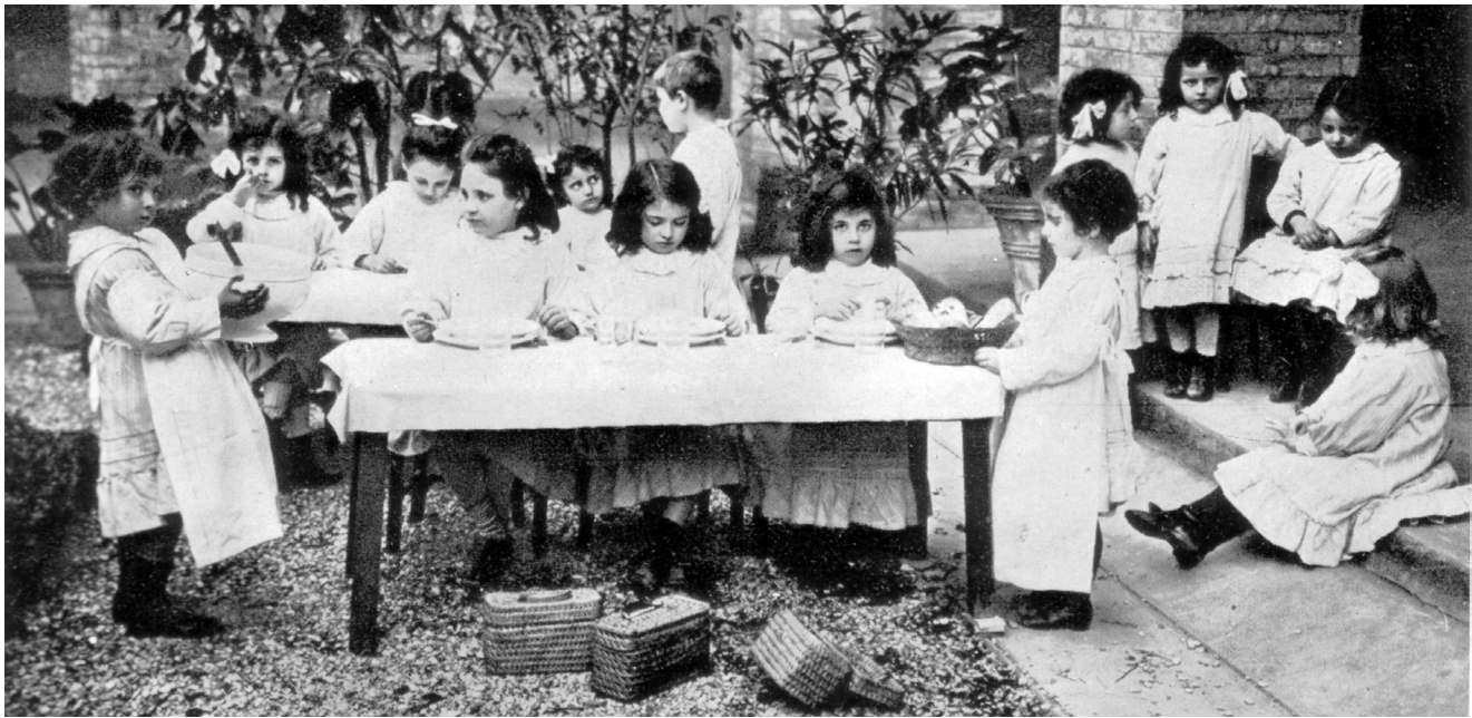
Lunch in the open air, the Cloister School, Via Giusti, Rome, around 1911

one for a library, one for a kitchen, another for a laboratory, and so on. To be condemned to reside in a prismatic space is depressing to the spirit.