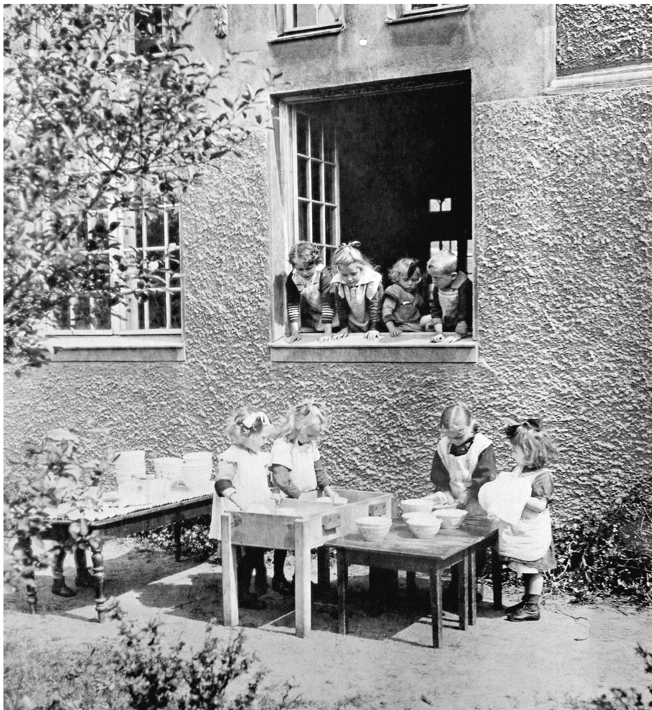
Workers and observers after lunch show great interest in washing the dishes—and sincere admiration in looking on, a Montessori school in Berlin, courtesy of Paola Trabalzini

gular, and circular shapes, etc. In Amsterdam, where a rectangular building was at our disposal, we put up partitions in the corners and created triangular rooms—four of them in the corners and the central room itself was hexagonal. Thus five rooms out of one were available for the children's use. The different corner rooms were utilized for different purposes: