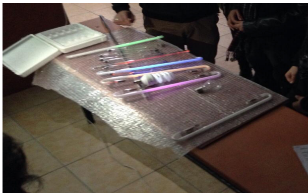
Figure 2. Experimental set-up

experimental demonstration in accordance with the goal of the study. The experimental system shown in Figure 2 consists of seven discharge tubes and a plasma stick. Discharge tubes filled with different gases (Ar, Neon, etc.) at different pressures. Electrodeless discharge generation was ensured by using plasma stick isolated by a glass tube with a high voltage (3-4 kV) and a high frequency (10 kHz). Because gas pressures and gas types are different in the tubes, different color plasmas occur. It can be explain to the students why plasmas occur in different colors.