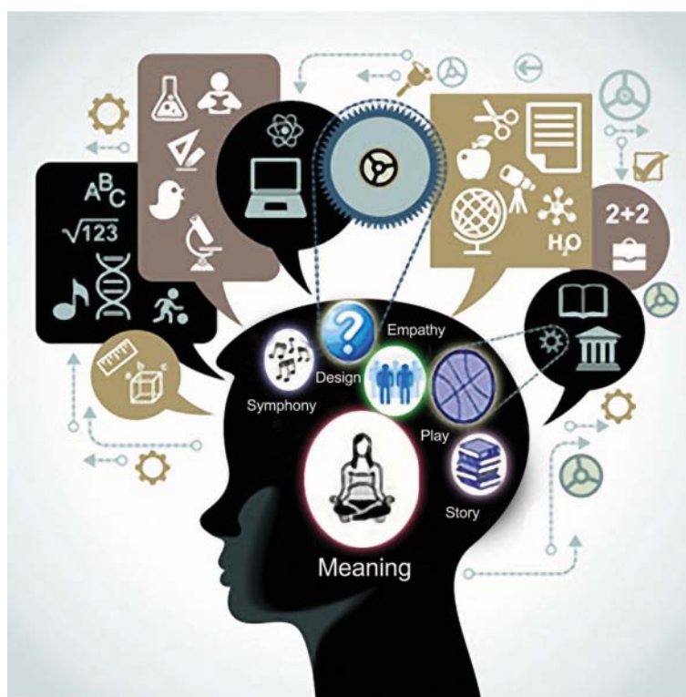
Figure 1: The Schematic Diagram of Conceptual Learning

Conceptual Learning emphasizes that the process of instructional design is no longer a single rational or creative one. Instead, it is the realization of the learner as well as the teaching designer's autonomy, initiative and subjectivity to the greatest degree.