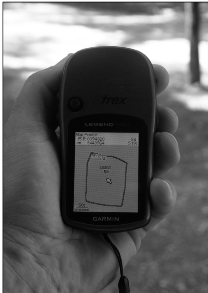
Figure 4. GPS recorded track on Garmin eTrex HCx GPS unit