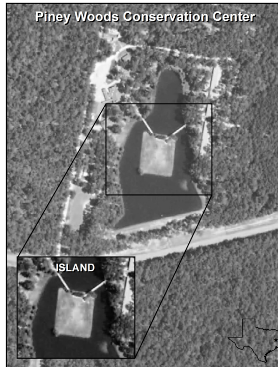
Figure 3. Island at Piney Woods Conservation Center used for GPS area measurements

Following waypoint data instruction, students then received one-on-one faculty instruction on how to use their GPS unit to interactively quantify area via a sequence of collected waypoints. Students were instructed how to identify a starting point for a GPS recorded track and asked to walk the perimeter of the island while receiving verbal instruction on how to save the island perimeter as a track resulting in an interactive calculation of area in the users preferred unit of measure (Figure 4).