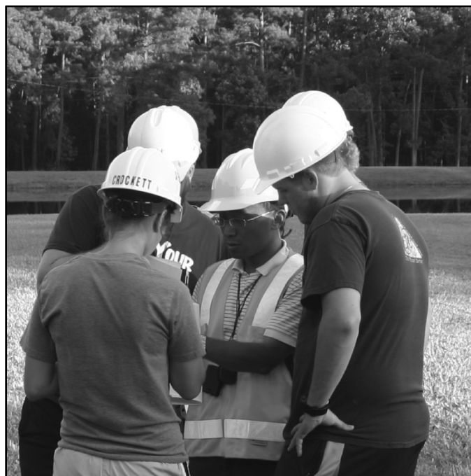
Figure 2. One-on-one faculty GPS instruction on the island at Piney Woods Conservation Center

A waypoint records the GPS derived real-world coordinates representing the actual location of each GPS unit. Students were also instructed how to collect waypoint location data in the UTM (Universal Transverse Mercator) coordinate system, the typical coordinate system required by most natural resource based entities. The island is the preferred place within PWCC for outside hands-on GPS instruction and represents a typical forest opening. The island provides a full view of the sky thereby minimizing multipath error making the initial introduction to students on how to use a GPS unit more effective (Figure 3).