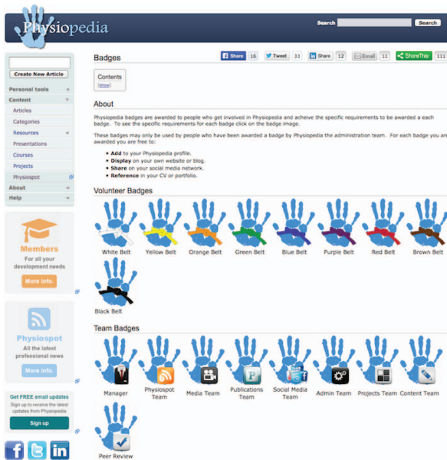
Figure 3: Physiopedia's open badges