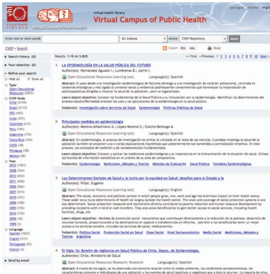
Figure 2: The VCPH virtual health library

VCPH maps fairly well onto the OPAL matrix, due to its extensive use of OER, its provision of MOOCS and self-directed open courses and its open policies. VCPH is a collaboration between over 100 institutions and organizations and since 2003 has assembled a multilingual online library of 190,000 items in total, with 5800 identified as OER (see Figure 2).