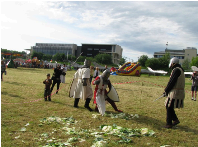
Figure 7. The Festival of Quarter XVIII, Czyżyny, 19 th June, 2011