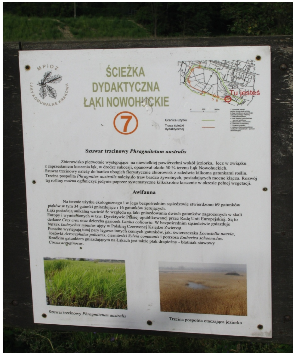
Figure 9. An information table from the didactic trail, informing about the reed habitat and the birds occurring in the Meadows