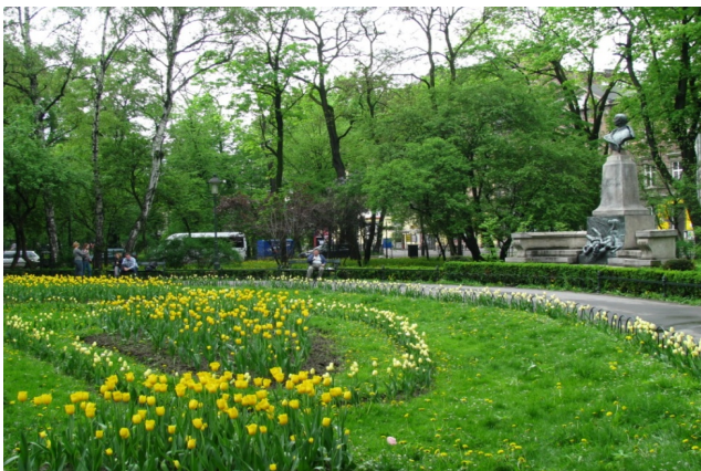
Figure 2. The north-west part of Planty. To the right – the monument of Artur Grottger (painter)

Table 5. gives the answer to the question “What brought you here for the first time?”. The answers were differentiated. In Planty the most common answer included “other”, among that 41% of answers (17 people) the ones mentioning “looking for shade” or “looking for rest” were predominant. Among these people there were also homeless people living there in summer. 24% of the respondents in Planty admitted that they got there by accident. In Błonia the largest number of people were brought by a mass event. In the Park of Aviators the largest number of respondents (28%) remembered that their first visit was connected with cycling. Cycling was also important in the case of the Nowa Huta Meadows(30%), nevertheless, in that place, the most common answer was “I live here”.