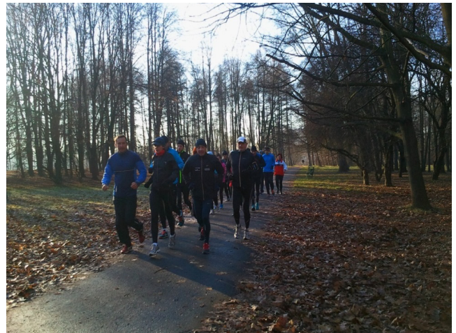
Figure 5. Students' training in the Park of the Polish Aviators