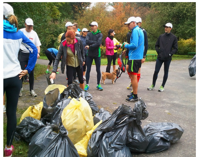
Figure 6. Students collect rubbish in the Park of the Polish Aviators