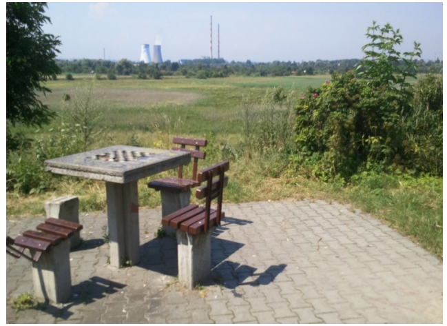
Figure 8. The Nowa Huta Meadows