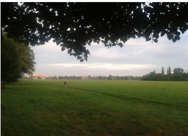
Figure 3. Błonia – a general view from the western side to the city centre, 14 th July, 2015