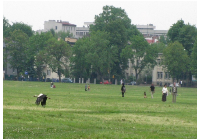
Figure 4. Błonia on 3 rd June 2012 – in the bottom-left part – a white stork Ciconia ciconia (Brisson)