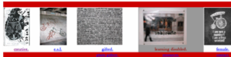
Figure 2. One page of a first year student's ePortfolio showing micro (eJournal) and macro (ePortfolio) views of important issues in teaching and learning.

The two strategies, together, offered a way to operationalize the criteria within the framework for authentic assessment presented earlier (Darling-Hammond & Snyder, 2000). The eJournals allowed "stop motion" in the blurred field experience, helping instructors to better determine students' growing understanding of inquiry-based teaching and learning and how that informs professional practice for formative assessment. The ePortfolio provided the vehicle for summative assessment, supported by multiple kinds of evidence over time and across different contexts.