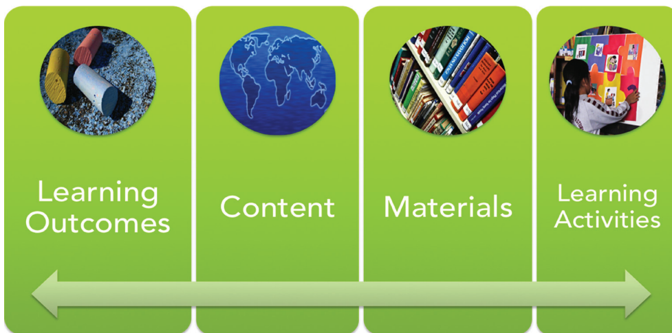
Figure 1. Course Components in Internationalized Curriculum. Course components for internationalized curriculum. Adapted from Helms, R., & Tukibayeva, M. (2014). Internationalizing the curriculum, part 3 . American Council of Education. Retrieved May 18, 2015 from http://www.acenet.edu/news-room/Pages/Intlz-in-Action-2014-March.aspx .

tution as to its local definition and implementation. Recognizing the need for that kind of support and to help faculty begin thinking about how to address the internationalization requirement in their courses, LWB and the iSchool collaborated to offer a one-hour web workshop called “Strate-