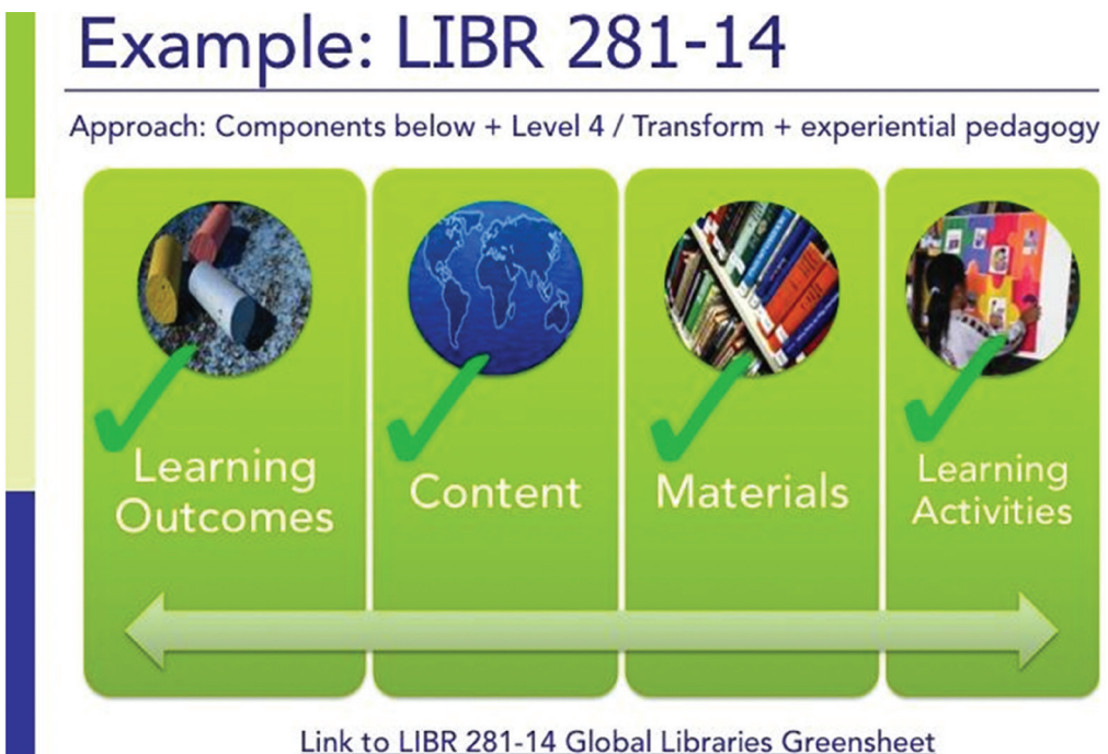
Figure 4. Model for iSchool/LWB Course: Examination of Global Library Issues Using Project Based Learning. As a result of the SJSU iSchool and Libraries Without Borders workshop and the models proposed by Helms and Tukibayeva (2013) and Sheryl Bond (2003), a new course was developed “Contemporary Issues: Examination of Global Library Issues Using Project Based Learning”. See also http://ischoolapps.sjsu.edu/gss/ajax/showSheet.php?id=6514 .