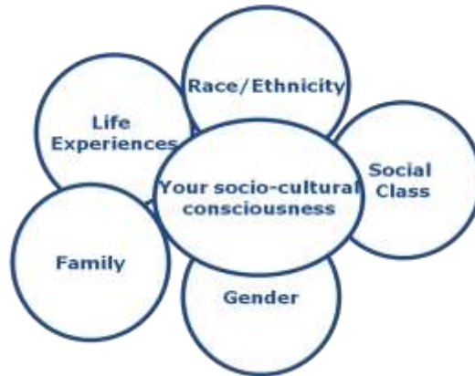
Figure 1: Socio-cultural Consciousness (adapted from Villegas & Lucas, 2002)

multicultural society (Villegas & Lucas, 2002). On a continuum of socio-cultural consciousness or dysconsciousness, we mirror our personal experiences and views of the world in our teaching.