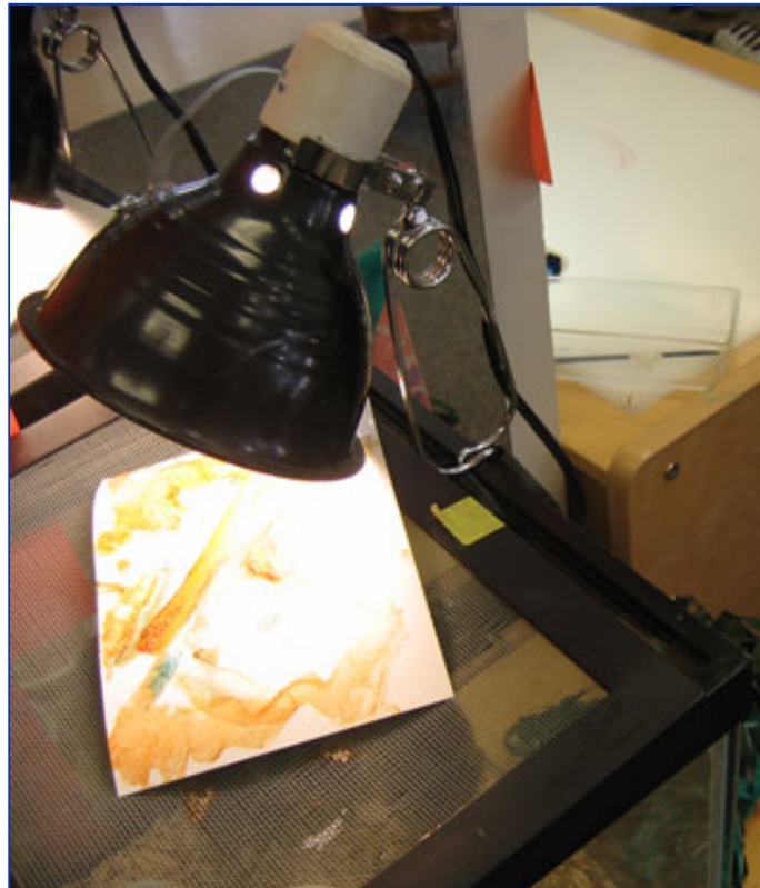
Figure 4. Dominic created a painting for the chicks and set it on their cage.

and concentrated effort creating a painting. When the painting was complete, Dominic took it to the chick's cage, turned it over, and placed it picture-side-down on the cage so that the chicks could enjoy it (Figure 4). This seemed to be a thoughtful and caring gesture from a child who had struggled with social interactions.