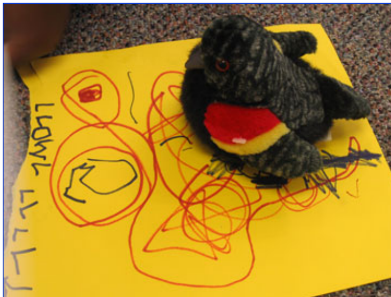
Figure 3. Dominic drew a bird nest and placed a toy bird in it.

Dominic had a surprisingly vast knowledge of animals as well as an emotional connection to them. He showed the animals a level of caring that he seemed unable to show his classmates. He made a nest for the stuffed birds by drawing with multiple colored markers on construction paper, then placed a bird in the nest (Figure 3). He created flowers for the classroom garden center that became a home for the animals. He spent long periods of time quietly reading books about animals with the intervention specialist. Although Dominic still had difficulties interacting with some of his classmates, we saw during the project work that he could make positive emotional connections, which the adults were then able to support and nurture.