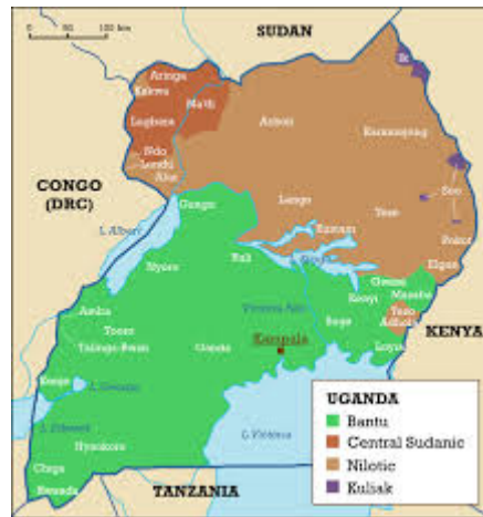
Figure 1. Ethno-linguistic Map of Uganda showing major Language Classifications