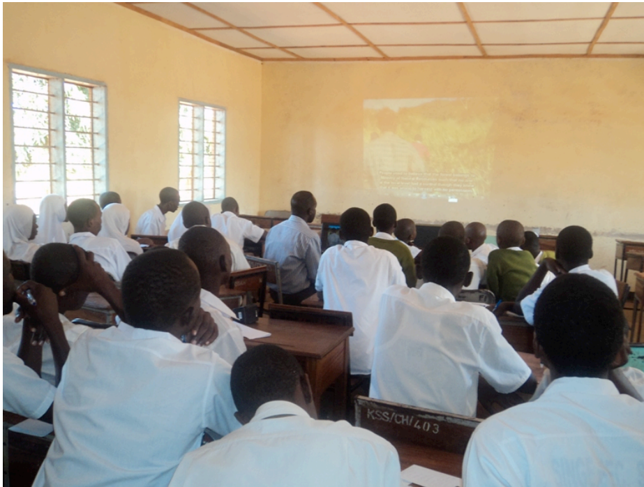
Figure 1: Students watching CASC video

The first step in the study was for the students to watch the three videos: a local CASC media artifact, the forest fire video from another context and a video explaining the PBL process. In Figure 1, the students in the experimental group are watching the local CASC artifact video.