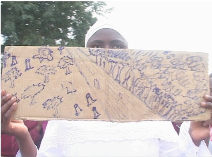
Figure 3: Student presenting and explaining her group's project

After the groups had identified their topic, they were given one week to work on their projects (Kihoza 2011). Up to this point, researchers had been involved with the students but from this point onwards the teachers were provided with a list of project titles and it was suggested that they provide the students with guidance, if and when required. The groups had to complete the projects in addition to their regular classes. The research team did not contact the groups during this week. The groups produced a theoretical document and showed, in practice, that the knowledge regarding environmental conservation had been well understood.