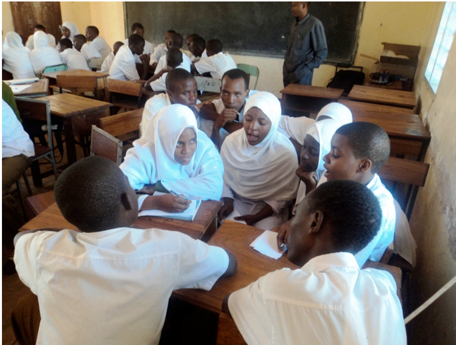
Figure 2: Students discussing the issue of forest fires