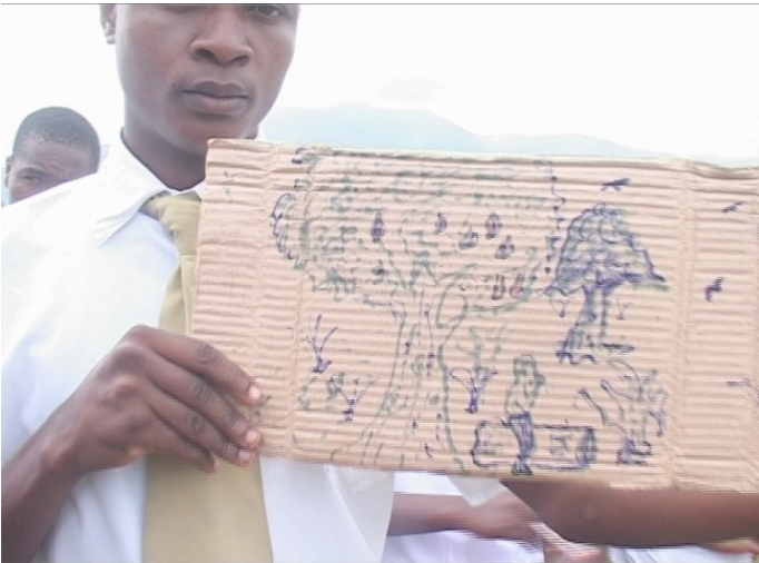
Figure 4: Student presenting and explaining his group's project

In the final stage of the PBL process the students were asked to present their projects. The aim was to describe the problem from a chosen viewpoint, summarise their understanding of the problem and discuss their solutions. Some of the presentations were conducted inside the