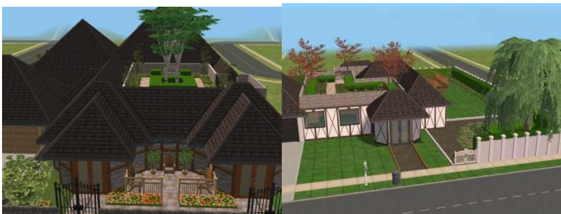
Figure. 8 Screenshots of the house designs ( Sims, Maxis ) from Dr. Spacey's team. House 1 (on the left) had an area of more than 5000 sq. ft whereas the downsized house 2 (on the right) had an area of 648 sq. ft.

Figure 8: Screenshot of Dr. Spacey's response