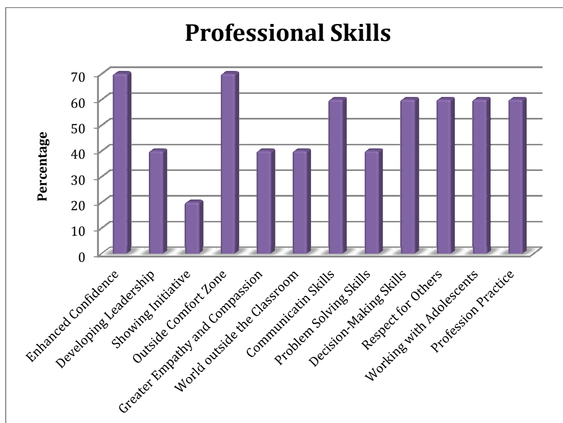
Figure 4: Professional skills developed through Service-learning

The focus of the service-learning unit on the need to develop an objective, unbiased attitude to lower socio-economic students helped me in building my relationships with my students. The impact of the ‘out of school’ situations that had been discussed during the Service Unit quickly became apparent. Personally it made me realise that my own school experiences were built on a fairly privileged background. I had never experienced anything like the situations that confronted these students.