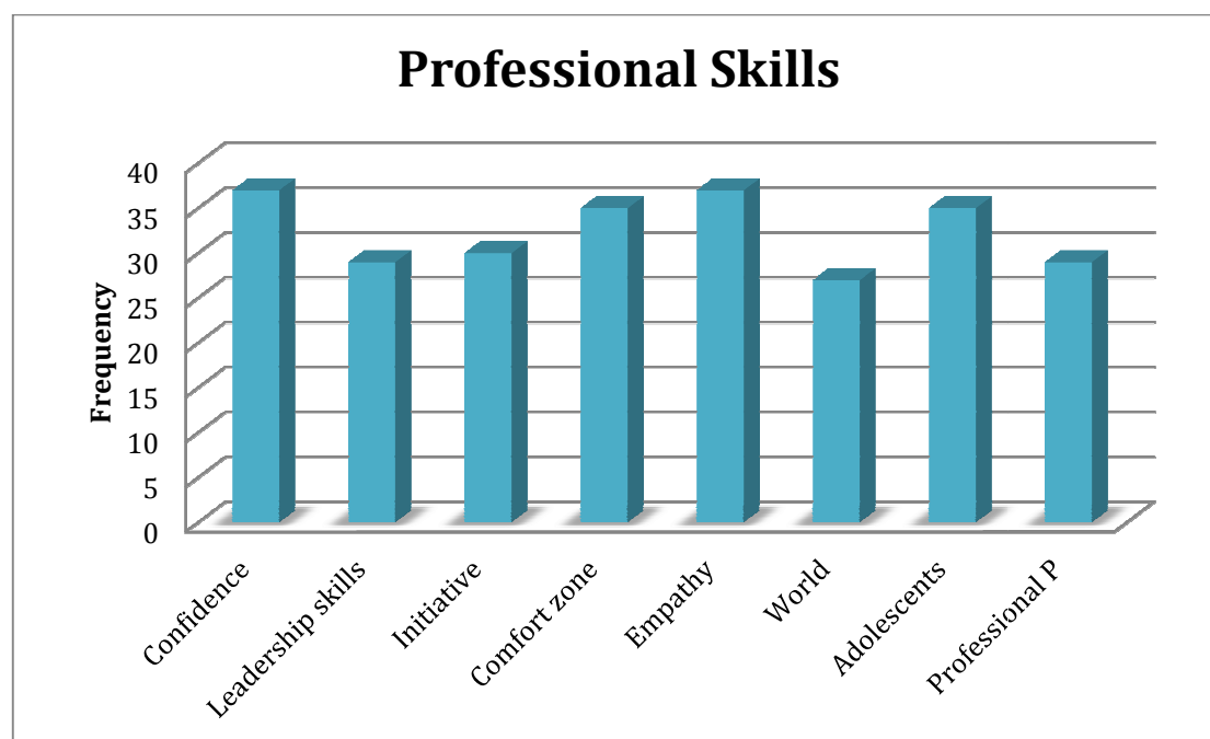
Figure 2: Professional skills developed through Service-learning