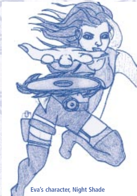
Eva's character, Night Shade

In her work on children's use of media and popular cultural symbols, Anne Dyson (1996) examines how young people's use of cultural symbols in their work reveals their view of the world and their values: “[C]hildren may position themselves within stories that reveal dominant ideological assumptions about categories of individuals and the relations between them—boys and girls, adults and children, rich people and poor, people of varied heritages,