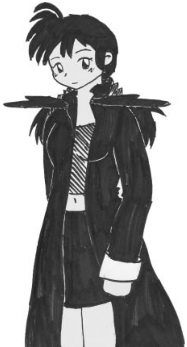
A Manga character created by one of the comic art class students