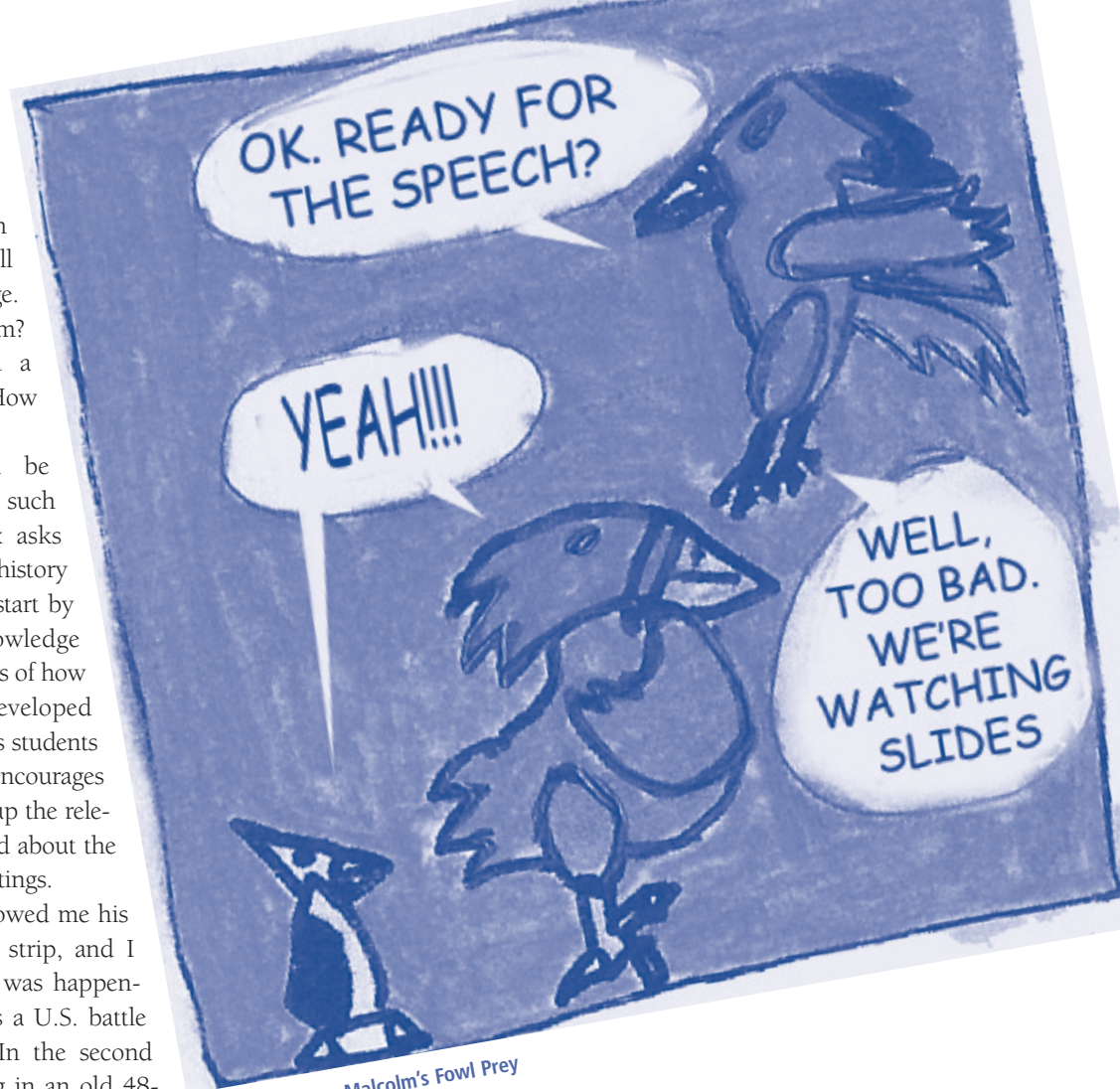
A panel from Malcolm's Fowl Prey

Producing comics not only supports young people's literacy development, but also promotes their identity development. As young people grapple with questions of identity during adolescence, comics production in the after-school program offers them a unique way to enter into an imagined world that allows them to experiment in safety