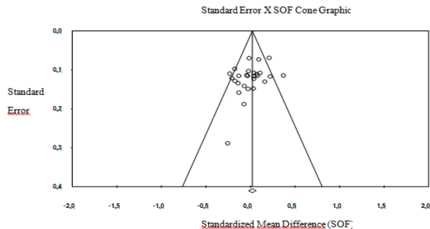
Figure 1. Cone Dispersion Graphic of the Studies with Effect Size Data on Differences among Teachers' Organizational Culture Perceptions in accordance with their Gender

As reflected in Figure 1, a majority of the 27 studies that were included in this study is located at upper side of the figure and very close to the conjoined effect size. In case there is no publication bias, studies are expected to expand symmetrically on both sides of the vertical line showing the effect size (Borenstein et al, 2009: 284). One of the studies (Karaman, 2011) that was included in this study to determine the conjoined effect size measured based on gender variable went beyond the pyramid but this study expanded around the top and the middle of the figure. If there was a publication bias in 27 studies that were included in this study, then, the majority of the studies will be located at the bottom of the figure or only at a single part of the vertical line (Borenstein et al, 2009: 284). In this sense, this cone graphic is an indicator of the absence of a publication bias in terms of the studies included in this study.