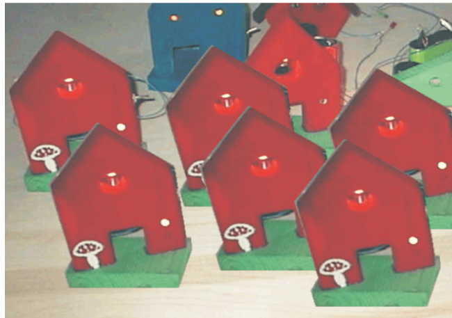
Figure 1. "Too often, the students reproduce artefacts, according to given models without any creativity."

and reproduce similar products, such as wooden boxes and other wooden artefacts commonly used in households.