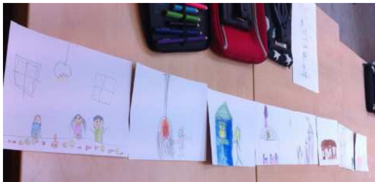
Figure 4: Hand drawn storyboard

The groups work out a paper based storyboard with hand drawn sketches (Figure 4) where they turn the requirements into a criteria for evaluation: Can others (5 th grade) understand what's going on?