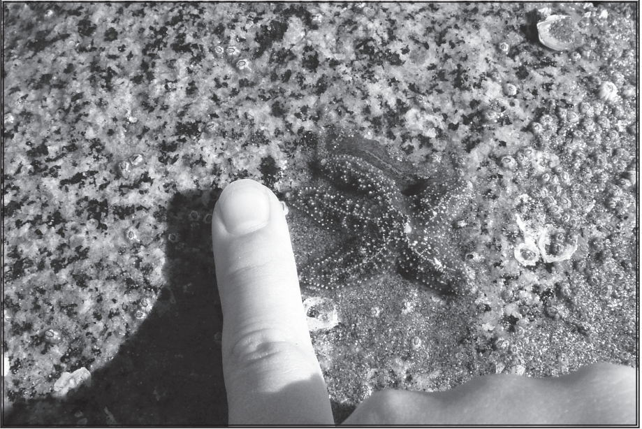
Figure 3. Student showing the relative size of a seastar with her index finger

The students also made note of changes they observed in the park over the course of the project. Most shared that the number of wasps was very high in the summer but much smaller in the autumn; some speculated that this was because wasps hibernated and hated the cold. In their letters, many students described the plants and animals that could be observed in different seasons, for example, puffballs and Amanita spp. in autumn. Students also wrote of changes to the beach with the tides and the animals that could be observed when the tide was low—sea anemones, seastars, horse clams, periwinkles, moon snails, and jellyfish.