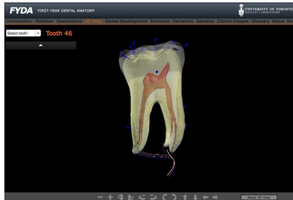
Figure 5: Tooth model displayed with adjusted transparency levels and hidden panels