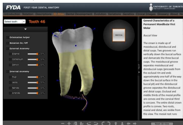
Figure 4: Screenshot of the 3D Atlas with all navigational and functional features displayed