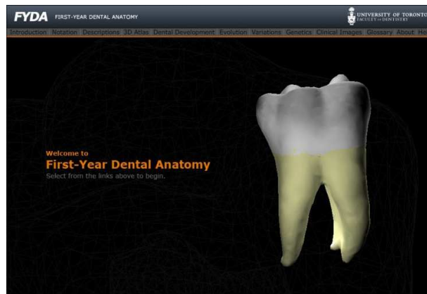
Figure 2: Splash screen in FYDA

The content of FYDA includes interactive 3D representations of dental anatomy, as well as animated 3D representations of dental evolution and development. FYDA has twelve modules that can be accessed from the application's main entry page shown in Figure 2. Without minimizing the importance of other modules, the 3D Atlas is described in more detail in the following subsection.