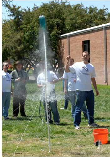
Figure 1: Rocket launch