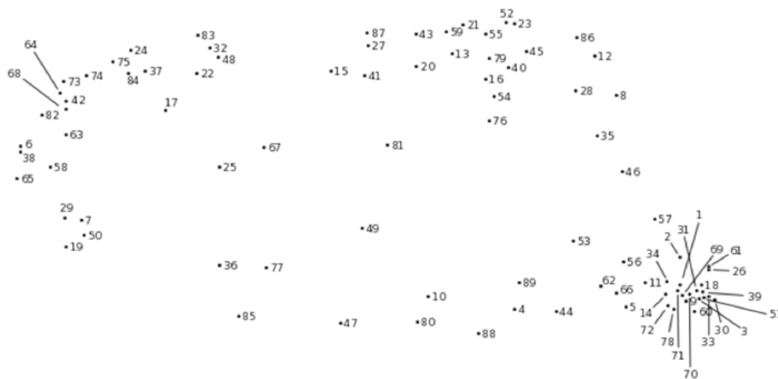
Figure 1: Point Map of Pre-Service Teacher Beliefs on the Antecedents to Bullying.

the map were more frequently sorted together than statements that are further apart. For example, in the centre top of Figure 1, points representing statements 27 (“defining others as other, and self as norm”) and 87 (“value conformity”) are close together. This means that they were frequently grouped with one another. In comparison, statement 10 (“alcohol abuse”) is further away on the map from statements 27 and 87, indicating that it was not typically sorted with the other two statements. A stress value was calculated to determine the reliability or goodness of fit of the map with the group proximity matrix. Stress values range from 0 to 1, with lower values representing a better goodness of fit than higher values. We obtained a value of 0.224. Sturrock and Rocha (2000) reported that multi-dimensional maps with a stress value of .39 or lower have less than a 1% probability of having no structure or a random configuration. Thus, our data can be considered to be very reliable.