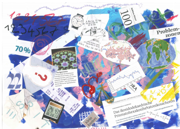
Figure 3. Picture created by P3, presenting a mix of technologies used.

This characteristic is one that is most difficult to analyse in the five pictures. As stated above, there are very few mathematical items are presented, therefore it is difficult to identify references between them. Particularly interesting in this context are the two pictures by P3 and P4. At first glance they depict a coherent image, but when looking closer both consist of various individual elements. And while many of these elements could be sorted or grouped (for example visual presentations, formulas or measurement tools in the image included below), this is not done by the creators of the image.