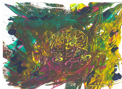
Figure 5. Picture created by P5, representing an integrated presentation of mathematics.

For me, the circle represents absolute order [...] Order also means to be able to orient yourself in the chaos and if one takes the relation to math, math to me is like a language with which you can create order in a chaos. So if from the outside something looks chaotic and you then look closer, with the help of math you can explain certain things or identify new dimensions within and a new understanding." (P5)