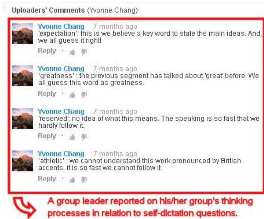
Figure 2. An example of group reflections in the YouTube comments area.

and had made inferences about it from a previous video segment on greatness. They thus proposed using a prediction from a previous video segment to assist them with guessing the correct word and inferring the main topic of the video context. Throughout the monitoring processes, self-regulated learning was expected to elicit information on whether students were using appropriate listening strategies to accomplish the activity. The implementation of the online-SDG learning activity from the YouTube platform was expected to activate a dynamic and mixed practice of metacognition strategy at different stages during the activity.