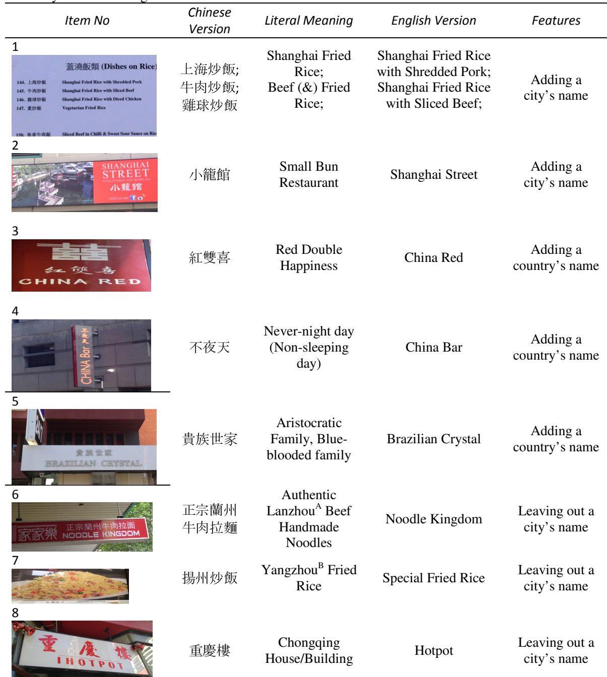
Summary Table of Bilingual Advertisements in Melbourne Chinatown