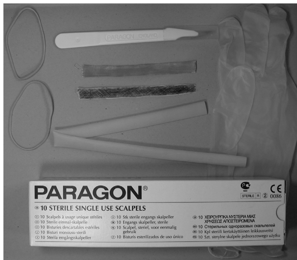
Figure 1. Material for construction of low-cost inguinal canal model

supplied to students who built it under teacher supervision. At the end of each lesson the same multiple choice test, composed of 13 questions relative to inguinal canal anatomy and hernioplasty procedures (Tab. 1), was submitted to the students of both groups. It was planned to perform the test in three blocks of 22 medical students (11 for the experimental and 11 for the control group) with an interim analysis after each block. A sample size of 33 medical students for each group was needed to reach a confidence level of 95% with a power of 80% ( \alpha=0.05 and \beta=0.2 ) on the assumption that, like in a previous medical students' group 67% of them committed at least one mistake in the multiple choice test and that the use of three-dimensional model would reduce this percentage to 30%. Data are expressed as numbers (%) and means (SD). The results were analysed using the Chi-Square Test and Fisher Exact Test, as appropriate, for proportions. For means we used the Independent Samples T Test. A p-value of <0.05 was considered to be statistically significant. The analyses were done with SPSS version 13.0 (SPSS, Chicago, IL, USA).