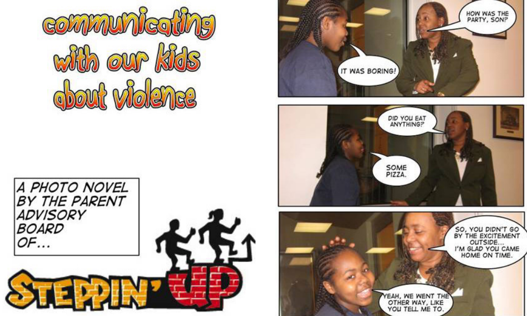
Figure 1. Photo Novella Sample Pages

reminder phone call was made the day before the session. Parents were able to reschedule visits to best fit their schedule.