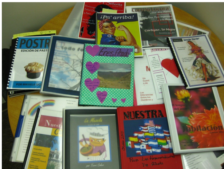
Figure 2. Photograph of Students' Magazines

adjunct to tenured- or tenure-track faculty is 2.6 in the Spanish Department, with the majority of lower-division courses delivered by adjunct instructors.