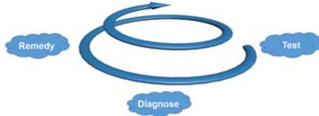
Figure 1. The continual improvement process in CSTPP

The entire learning process involved an uninterrupted cycle of Test, Diagnose, and Remedy, forming a progressive improvement learning process (as shown in Figure 1). With the CSTPP, students who exhibited a superior performance spent less time in the remedy stage, showed enhanced learning progress, and were not restricted by the progress of the rest of the class. Students who exhibited a less satisfactory performance developed their confidence and overcame the barriers to their learning by continuously addressing their subject-specific weaknesses after each cycle.