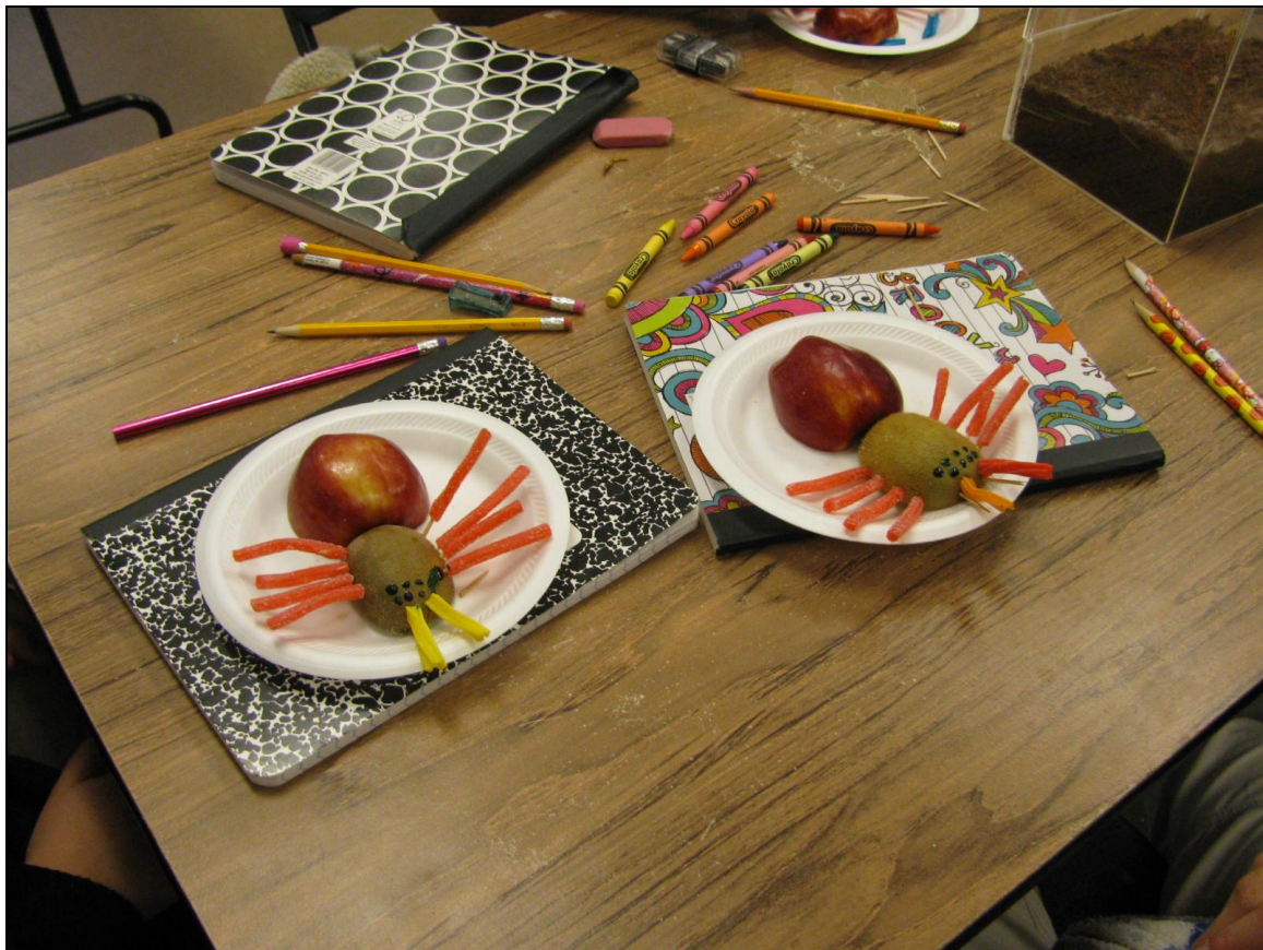
Figure 3. An example of two children's spider models built from fruit and candy.

Other shorter enjoyable hands-on spider lessons occurred during the main activity that let the children observe the spiders and their behavior. For example, Figure 3 shows anatomically correct spiders that children made after observing the living Poecilotheria spiders. This lesson also allowed the children to explore how the spider's characteristics allow them to perform ecologically beneficial services that strengthen ecosystems.