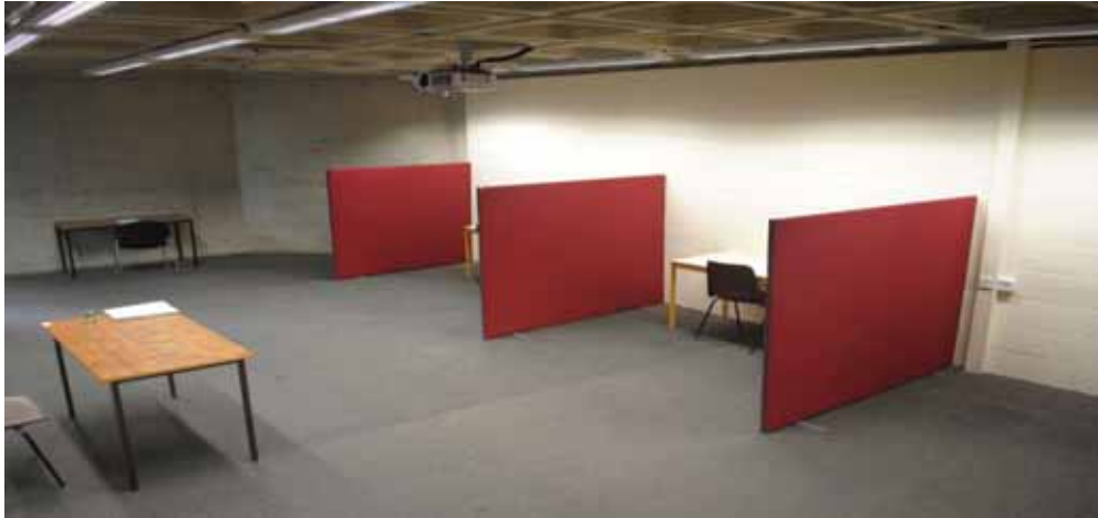
Figure 4. The Four Seat Low Distraction Venue