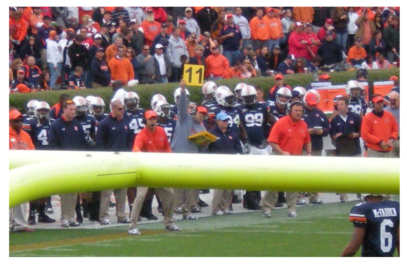
Figure 2. Signaling the defensive play, a coach holds up a yellow sign inscribed with a black number during a 2008 game between Auburn and Georgia. Notice the thick stack of cards in his left hand. He is flanked by two coaches sending hand signs who are partially obstructed by the goal posts cutting horizontally across the image.

Despite all the work that goes into constructing and teaching a play and then transferring it across various representational media, the play remains an empty vessel—a multimodal text such as in Figure 1, a number as in Figure 2, or a verbal command—until it is embodied on the field (see Figure 3). When the play is visually flashed to the captains, and when the captains verbally relay the play to their teammates, the play ceases to be a floating and empty text—how ever complex it may be—and becomes embodied and then enacted publicly. Prior to this public embodiment, these plays are clandestine documents, hidden from the public and performed in the privacy of a team's practice or written in the secrecy of a locker room. Prior to this public embodiment, these texts are guarded carefully, yet, paradoxically, have no present, only future, value. In other words, a team does not win a game simply by sketching a creative and innovative play, circulating solely in their narrow community of practice. Accolades are not awarded for plays. A team wins a game, accolades on showered on players, coaches, and programs, based on the effective embodiment of these plays.