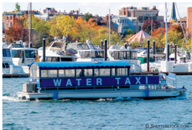
A water taxi cruises toward the dock in the Baltimore, Maryland, harbor.

Ferry boats that transport up to 1,700 passengers—or hundreds of passengers and their cars—operate on bays, harbors, and rivers. The single busiest ferry service in the country is the Staten