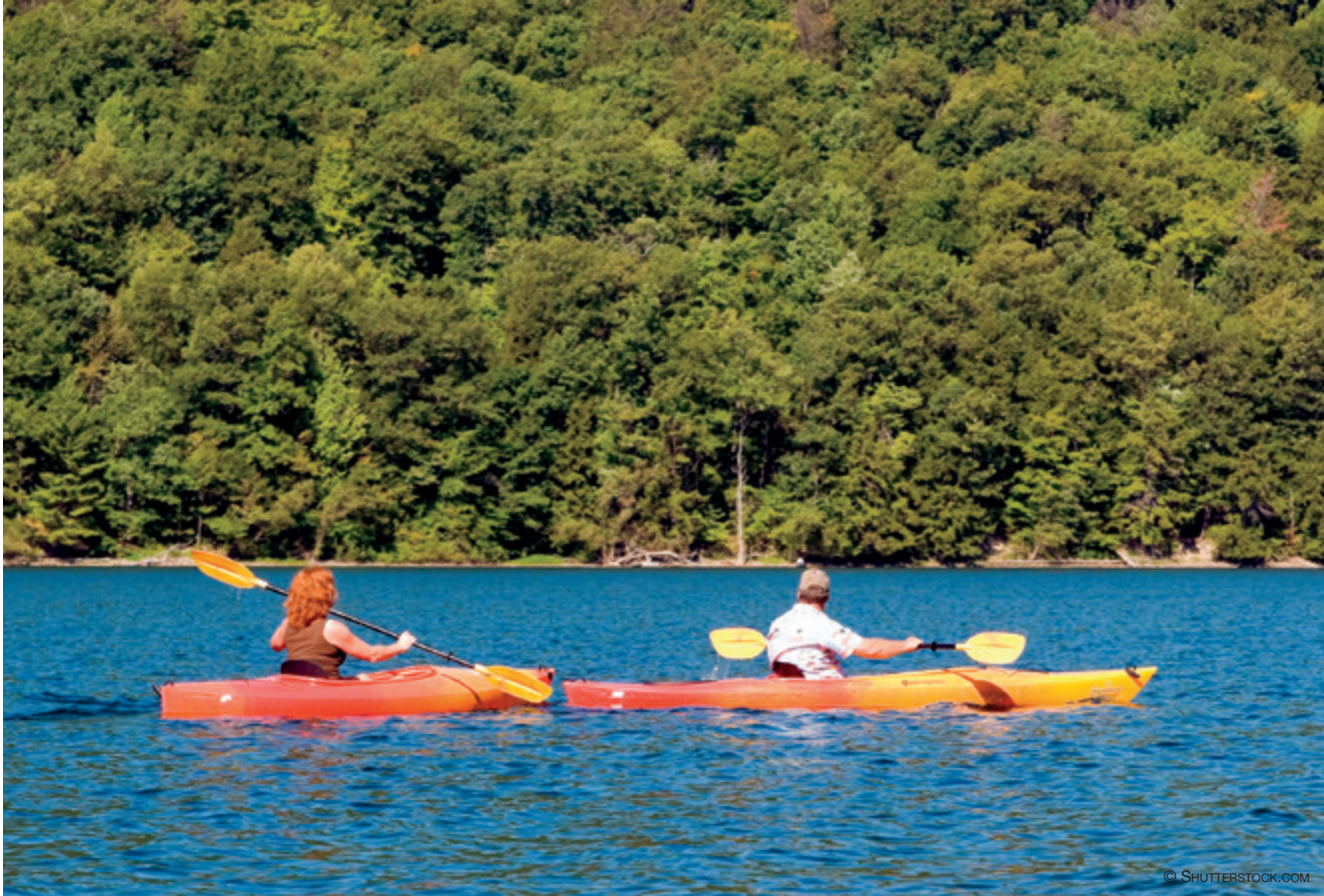
Two kayakers paddle along on Canadice Lake, one of the Finger Lakes in New York state.