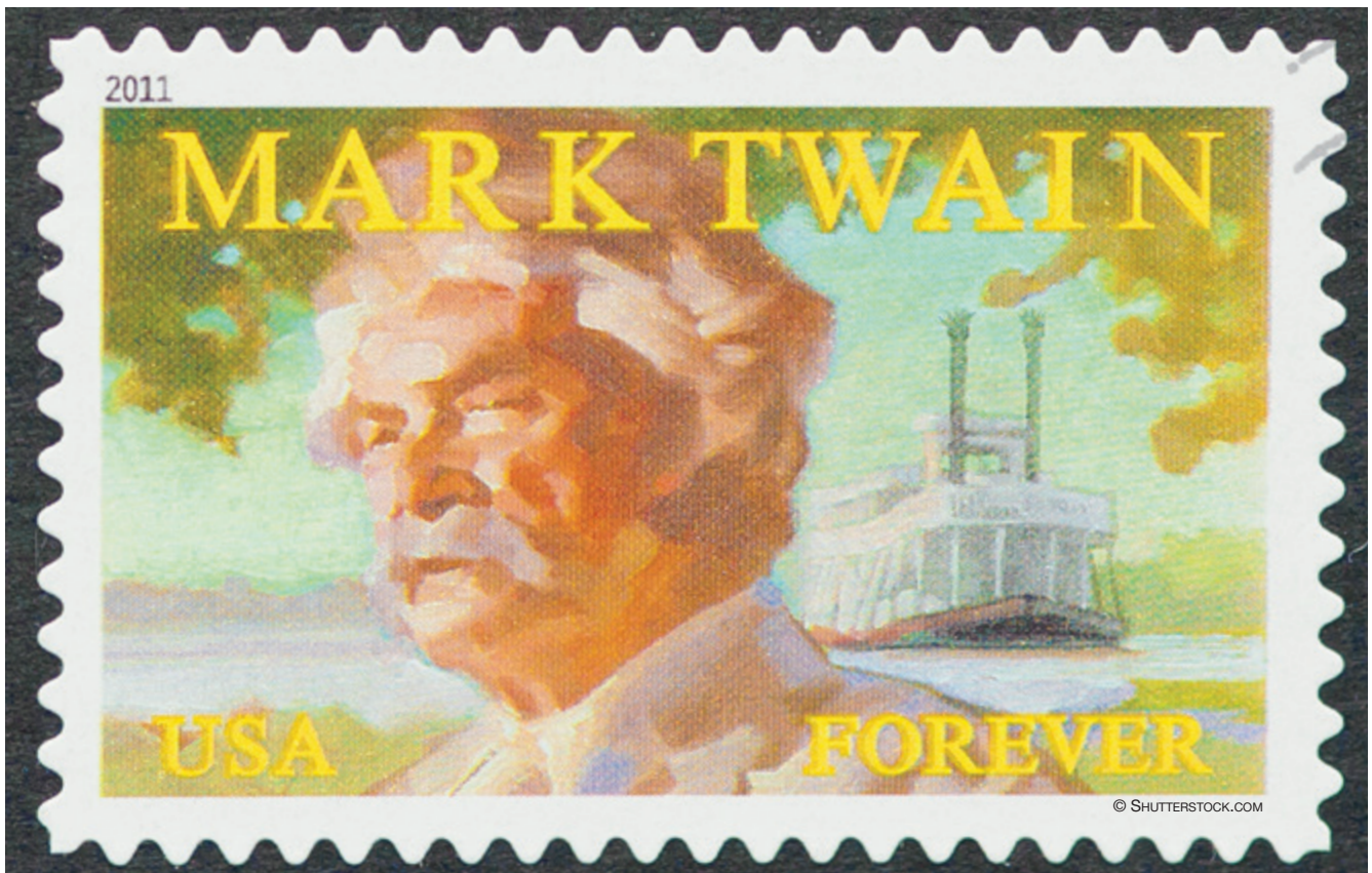
This postage stamp honoring Mark Twain depicts his connection to steamboats and the Mississippi River.

The floating theaters that brought entertainment to Mississippi River towns inspired another popular novel, Edna Ferber’s Show Boat , published in 1926. The novel—which portrayed the lives of the actors and workers on the Cotton Blossom showboat—led to a Broadway musical and film of the same name that featured the memorable songs “Ol’ Man River” and “Can’t Help Lovin’ Dat Man.”