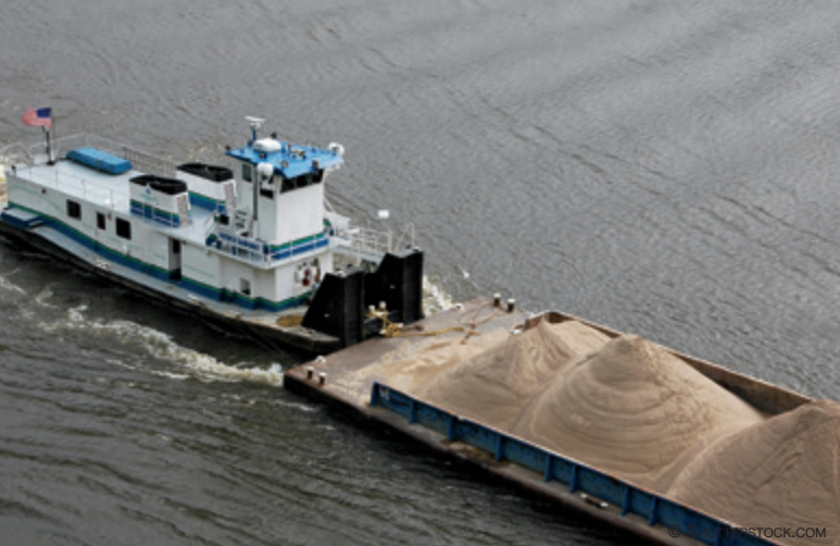
A towboat pushes a barge loaded with sand down the Mississippi River near Saint Paul, Minnesota.