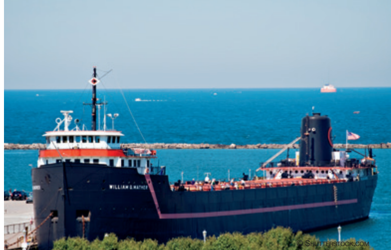
The William G. Mather , a retired Great Lakes bulk freighter, is now a ship museum docked on Lake Erie in Cleveland, Ohio.

the Great Lakes, making Lake ports closer to some European markets than ports on the East and Gulf Coasts. More than 200 million tons of cargo, primarily iron ore, coal, and grain, is shipped through the Great Lakes each year.