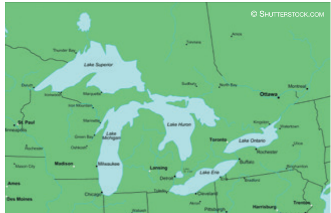
Each year more than 200 million tons of cargo is shipped via the Great Lakes, which have port cities in several states and Canada.