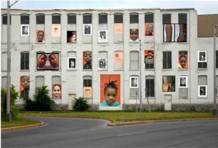
Figure 5. Photo portraits created by schoolchildren of Syracuse's Near Westside signal change in the making, covering one side of the long-vacant Case Supply Warehouse, which the nonprofit Near Westside Initiative is renovating to house regional public television station WCNY and ProLiteracy, the world's largest literacy organization, which is based in Syracuse.

literacy organization, ProLiteracy International, and soon will house WCNY, the region's public television affiliate—two organizations whose missions in communications and education speak directly to the 21 st century challenge and promise of tapping the vast pool of talent in neighborhoods such as the Near Westside. Other businesses that have relocated to the neighborhood or started there since 2006 include an architecture firm, a recording studio, a coffee shop, a fitness center, and a bakery. To support continued development and growth of the 140 businesses already in the neighborhood, the Near Westside Initiative has helped organize a business association.