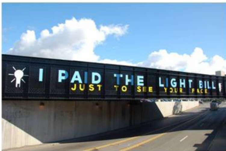
Figure 3. One of the six murals painted on old train trestles in Syracuse's Near Westside neighborhood by celebrated graffiti artist Steve Powers that have turned perceived barriers into gateways.

A Love Letter to Syracuse is meant to be from Syracuse to Syracuse. We found as we were painting it, it is also to industry, to the trains that pass over the bridges, to the act of painting hot steel in the summer, to collaboration, to polite drivers, and especially to improvisation (Powers, 2010).