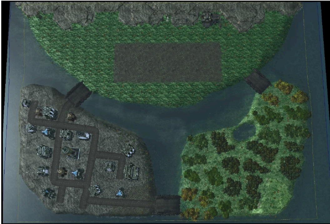
Figure 2: Starvest, an example level created by students using the StarCraft II editor