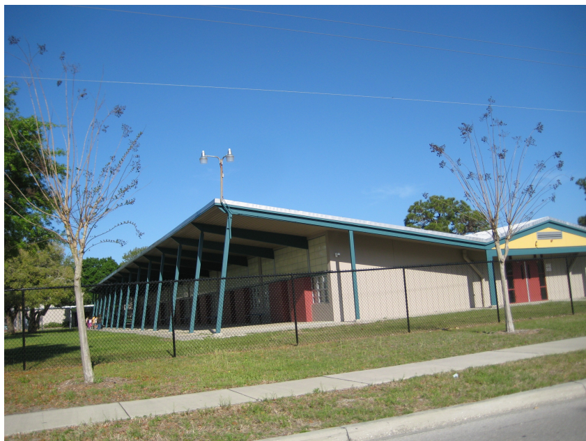
Image 6: Alta Vista Elementary School Addition, main façade, looking north, April 2010.

wind damage. “We had to make many of these changes to meet updated building codes,” Dr. Barbara Shirley, Alta Vista’s knowledgeable current principal ruefully explained to me one Monday morning before school. But perhaps the most striking