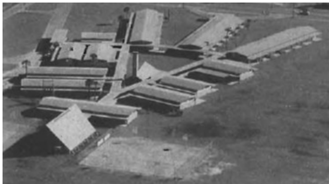
Image 1: Brookside Junior High School, aerial view.