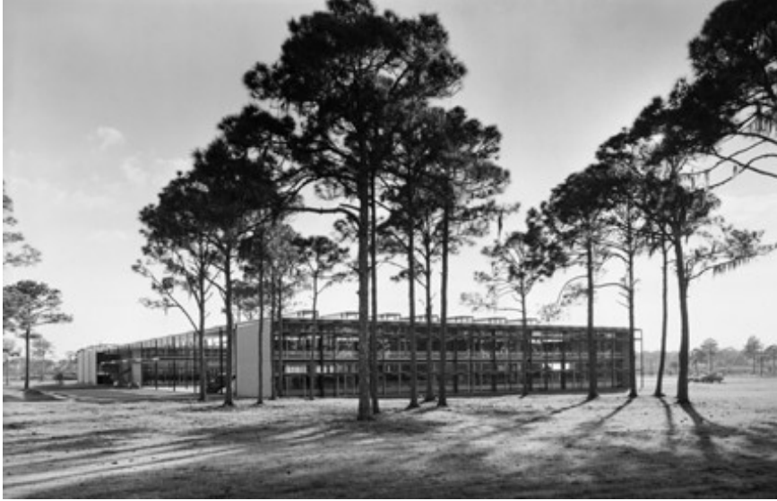
Image 8: Riverview High School.

Perhaps most notable among Riverview's many innovative features were Rudolph's unique structural responses to the Florida climate. To control for sunlight, but to still allow for air circulation, Rudolph designed a non-electric, energy efficient system that featured series of sunscreens--or suspended horizontal panels made from precast concrete--which alternated in their top-and-bottom placement. These panels covered the school's upstairs and downstairs hallways, which Rudolph located outdoors. (Rudolph's innovative idea for announcing a structure's pedestrian flow outside instead of inside a building's primary shell would be reprised in Richard Rogers and Renzo Piano's revolutionary inside-out building design for the Pompidou Center in Paris 30 years later.)