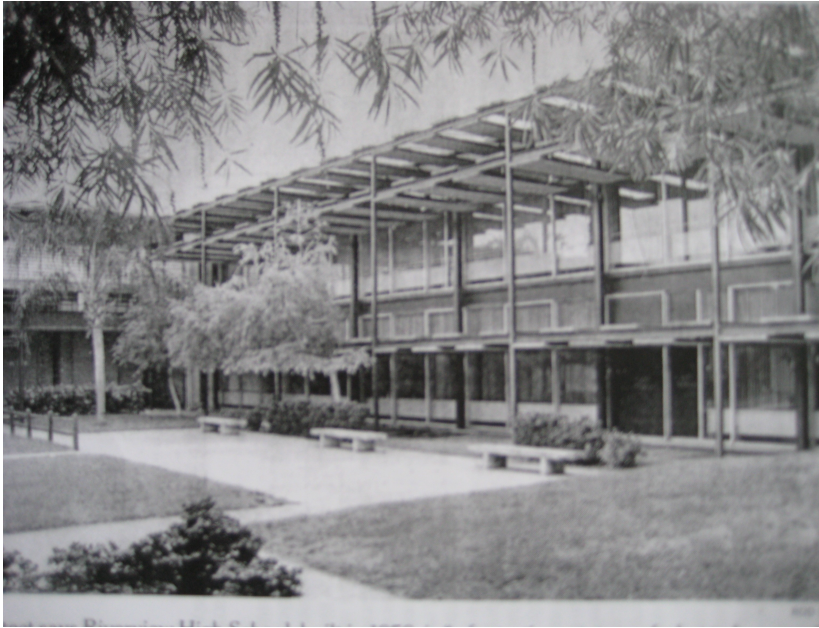
Image 9: Riverview High School, courtyard view.