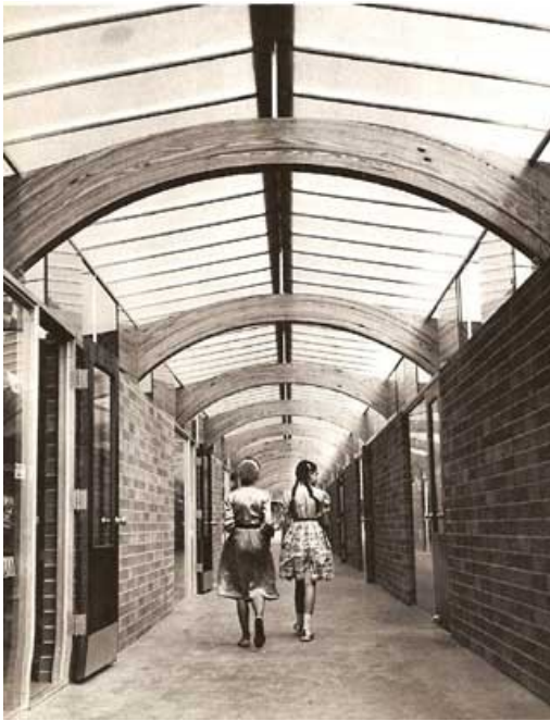
Image 4: Alta Vista Elementary School Addition. Inner Atrium and Corridor.

Classrooms in the Lundy addition opened along a long central atrium surmounted by a full-length glass skylight that further amplified the sensation of openness and light. To dissolve the long-standing architectural isolations of classroom and school space from the outside world, each classroom had floor-to-ceiling glass windows and sliding glass doors that promoted extended possibilities for teaching and learning. The classrooms themselves were separated by flexible partitions (rather than fixed walls) that could be opened or closed for diversified student groupings and large/small team-teaching opportunities. Lundy's imaginative attention to even the most taken-for-granted detail is also revealed in his interpretation of the addition's brick walls at the east and west ends of the building. The rhythmic, alternately-cast brick surfaces with their rows of chevron motifs further emphasize the wing-like architecture of the building itself and simultaneously suggest the endless folding and unfolding processes inherent in the activity of learning and the educational experience.