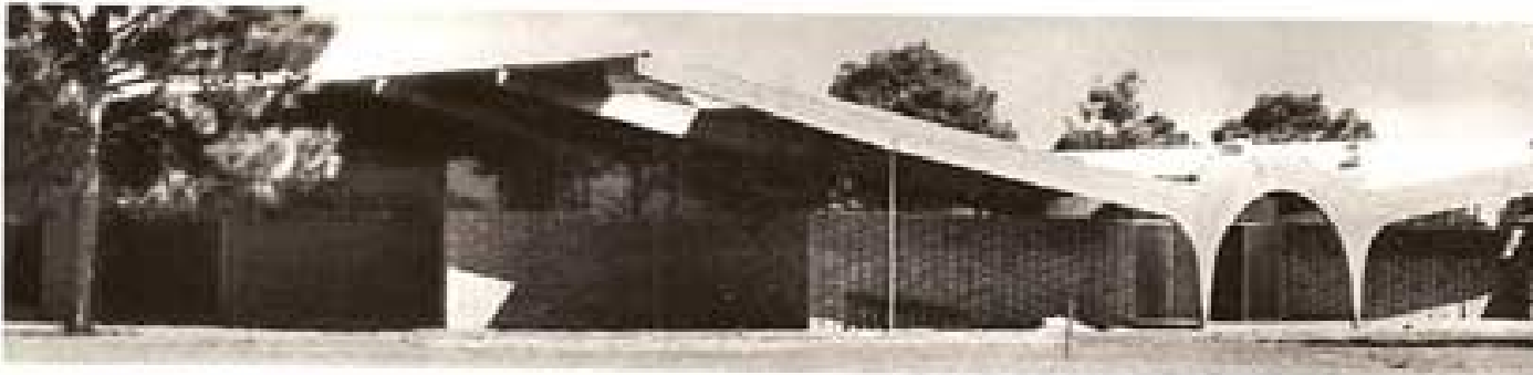
Image 2: Alta Vista Elementary School Addition, main façade, looking north.

The addition to the Alta Vista Elementary School was the second school built in the Sarasota County School Building program. Designed by Victor Lundy, the 12 room addition opened in 1957 and was a dramatic departure from the original box-like elementary school that itself was constructed only four years earlier to provide for a growing population on Sarasota's East side. Lundy's design was visually defined by its soaring, upswept, double-wing roof with 18 foot overhangs that ran the entire length of the building. Constructed from native yellow pine and fir and integrating laminated technologies, the beamed roofline conveys the impression of flight, as if the entire building were soaring above air, a feature that gave the addition its popular name, "The Butterfly Wing." In his notes, Lundy remarked how he consciously designed the addition "for the effect it would have on the kids. [The building] has a feeling of optimism; it shoots upward and outward."