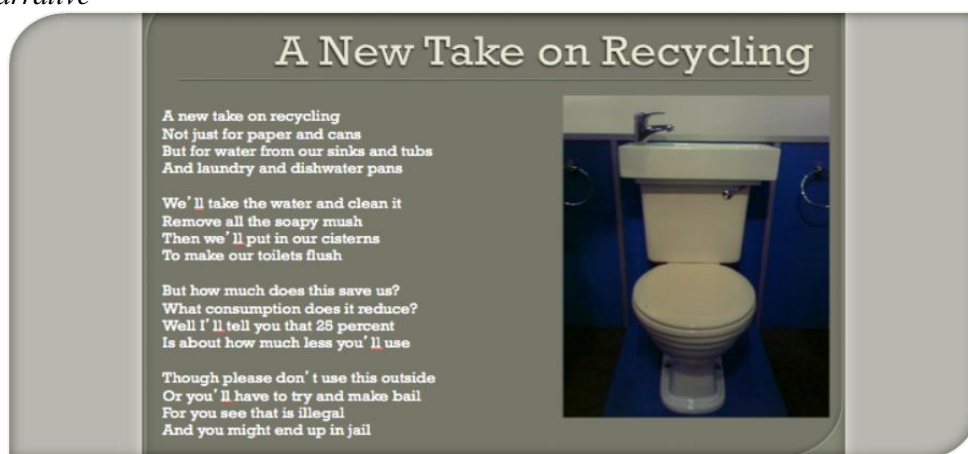
Figure 5: A student from Southville asks questions to begin probing alternative definitions to recycling available in his area