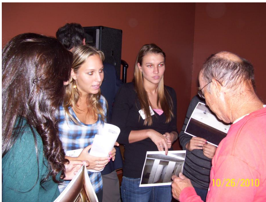
Figure 6. Students talk with an informed community member about their photos of energy usage in the dorms

community, which assisted with the dialogue. When the students were talking about their investigation, they were holding their photographs, which helped to provide context to the issue they were describing. Below we describe the benefit to using the approach of photovoice as one means by which to connect learners to science in their community.