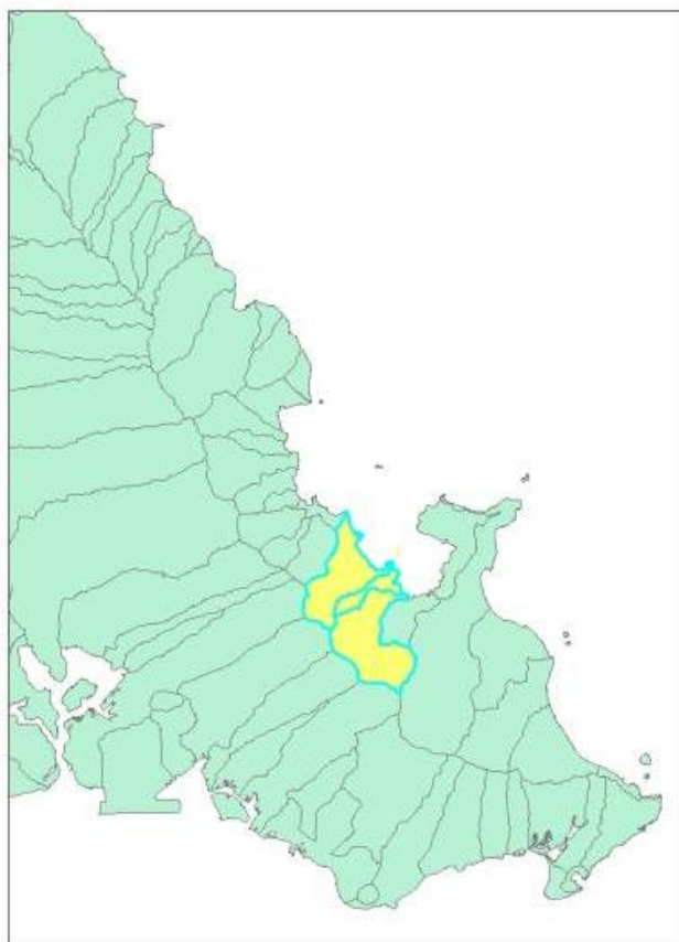
Figure 1. Map showing the south east area of the island of O'ahu. The Kāne'ohe, He'eia, and Kea'ahala watersheds (highlighted in yellow) provided the contextual backdrop for the course

The program we conducted was funded by a National Oceanic and Atmospheric Administration Bay-Watershed Education and Training grant to HIMB. The course occurred in June-July 2009 over a four week period during the summer break, and provided a total of six upper division UH credits through the College of Education's Curriculum Studies Department in (1) Interdisciplinary Science Curriculum and (2) Methods and Materials in Science. In addition, a modest stipend was provided to support teacher participation and help them pay for the costs of enrolment in the two courses. The instructors were marine biologists from HIMB and WCC, whose primary areas of expertise included coral biology, population genetics, and fish physiology. Classes were held at the WCC campus which has both classroom and laboratory facilities, and at the research institute of HIMB, as well as various outdoor