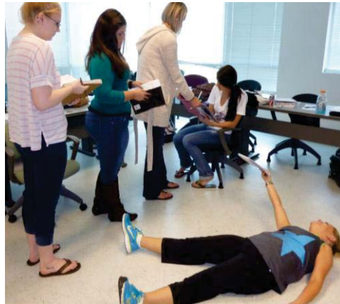
Figure 4: Preservice teachers enacting a student's tantrum.

In addition to the visual affordances of tableau, changes in role necessitated changes in the body; changes in the body created changes in perspective and insight; and, ultimately, changes in insight created changes in role and stance. Empathy is deeply rooted in the body experience, and this enabled us to recognize “others” as people like us (Gallese, 2001).