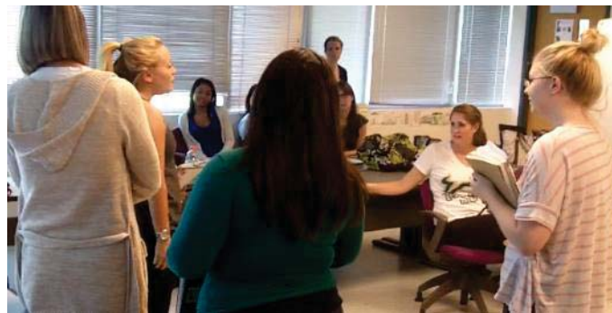
Figure 5: Character step-out to discuss the tableau.

For example, one group shared an experience in which a preservice teacher witnessed a student throwing a temper tantrum because the classroom teacher wanted him to wait in line to have his work checked. In Tableau A (Figure 4), the preservice teacher is not depicted in the tableau. Instead, we are viewing the scene through her eyes, and we see the classroom teacher ignoring the temper tantrum and attending to the students in line. The teacher is turned away from the child on the floor, focused on the text of another, and the other students are trained to do the same, although two of them steal subtle glances at their disruptive classmate. The ensuing discussion revealed that the preservice teachers strongly identified with the classroom teacher. Their comments focused on behavior management strategies, Attention Deficit Disorders, and a general amazement at the teacher's ability to ignore the distracting behavior of “that” kid (every classroom has one). In general, the preservice teachers viewed this scene as a lesson.