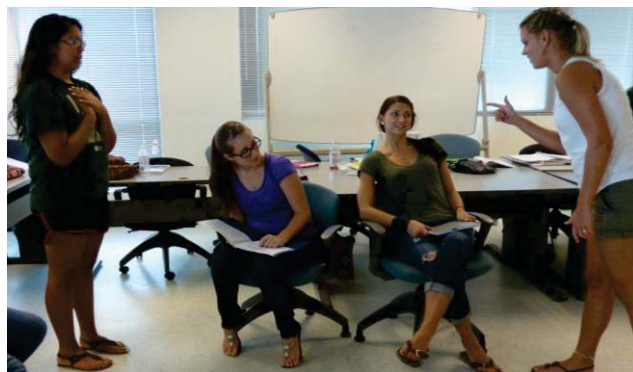
Figure 6: Preservice teachers enacting a screaming teacher.

For example, one group recounted a scene in which a preservice teacher watched in horror as the classroom teacher screamed at a child. In Tableau A (Figure 6), the preservice teacher represents the powerlessness preservice teachers often feel as visitors in classroom contexts. They are not yet teachers, they do not have pedagogical expertise, and they are passive witnesses to