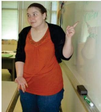
Figure 2: Preservice teacher at the whiteboard.

The visual representation of reflection was an affordance that was strongly evidenced in the video analysis. The careful positioning of people within the tableaux and what they communicated through bodily and facial semiotics was clearly documented. The preservice teachers discussed the visual representations thoughtfully and contributed to each other’s ideas.