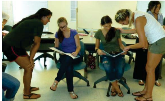
Figure 7: Preservice teachers enacting classroom co-teachers.

malpractice. The preservice teacher's disequilibrium is demonstrated in the asymmetry of this scene. The classroom teacher holds the power, and everyone must yield.