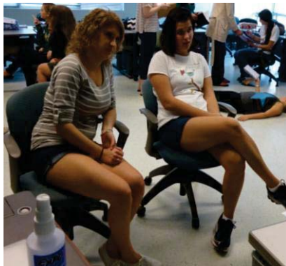
Figure 3: Preservice teachers acting as students who don't understand, in tableau.

The rest of this small group, shown in Figure 3, portrayed the students as confused, and there is a marked contrast between the preservice teacher's desperation (Figure 2) and the "children's" lack of interest or connection with what is being taught. The angling of the heads suggests confusion, the crossed legs convey a resistance to what is being taught, and their body language in general suggests that they would rather be somewhere else. Their character step-outs revealed another side to the story: "What is she talking about? What's the main idea—about what? We haven't read anything yet!?" When the preservice teachers heard the students' perspective, a communal wondering occurred: What if the elementary students could not define the main idea because they viewed finding the main idea as a process that occurred in the act of reading? The preservice teachers discussed the need to view classroom situations from the perspectives of the students; they contemplated the power of their words, and they lamented the pressures of teaching for a grade.