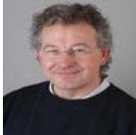
F.H.T de Langen Open University, The Netherlands