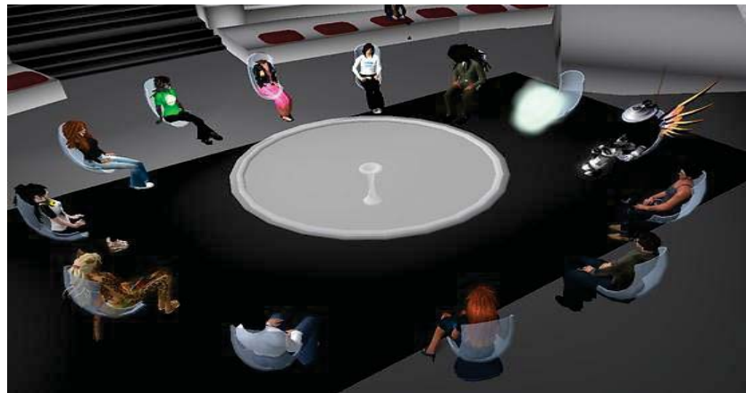
Figure: 2 A hybrid Space example from 3D Virtual world

As a consequence of intensive usage of technology in everyday life, the techno-culture emerged. In this culture, the presence of the physical and digital world can overlap each other and creates a new space called "hybrid space". Hybrid space occurs when one no longer needs to go out of the physical space to get in touch with digital environments (De Souza, 2006). To Darmawan (2009), hybrid space is where the boundaries are blurred and where it is hard for people to determine the distinction between physical and virtual spaces. An example of hybrid space from 3D virtual world given in Figure: 2 below.