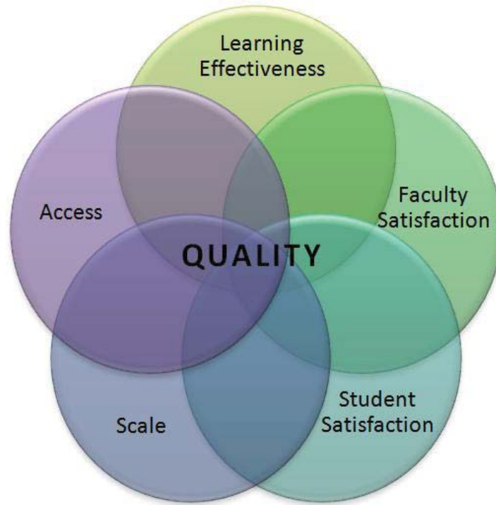
Figure: 2 Sloan – C Quality Framework (Moore, 2005).