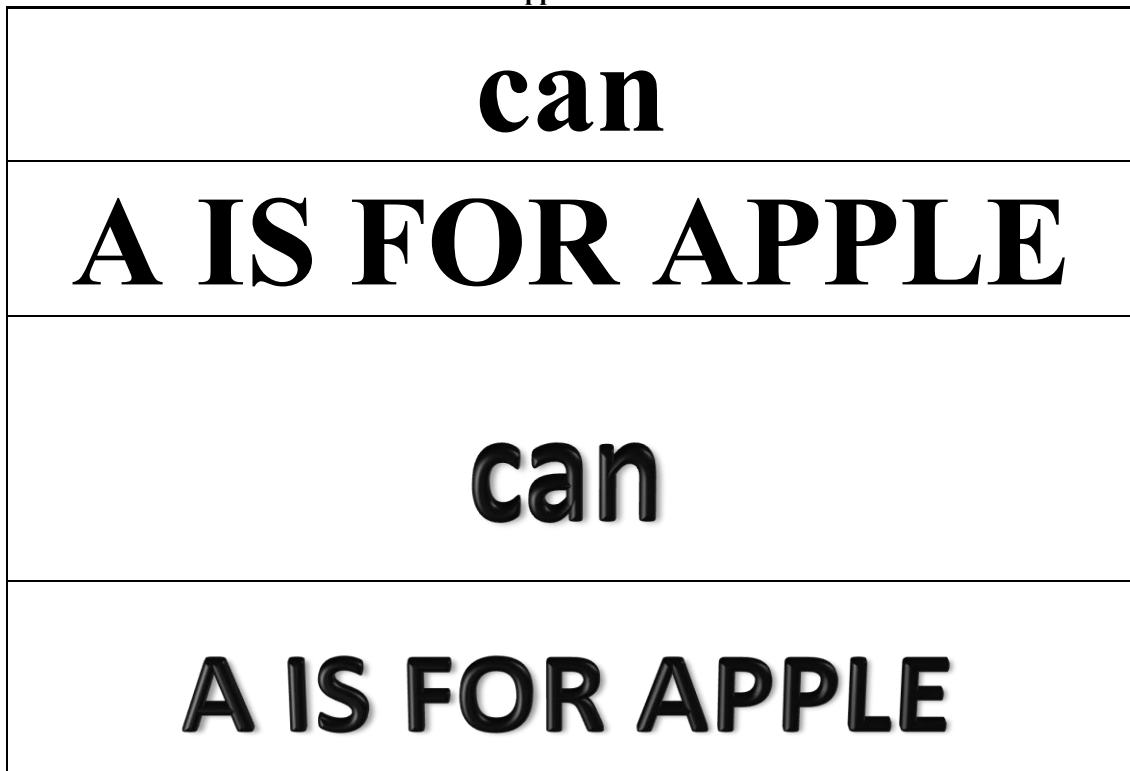
Figure 1: Example of Print Difference between Flat and Three Dimension