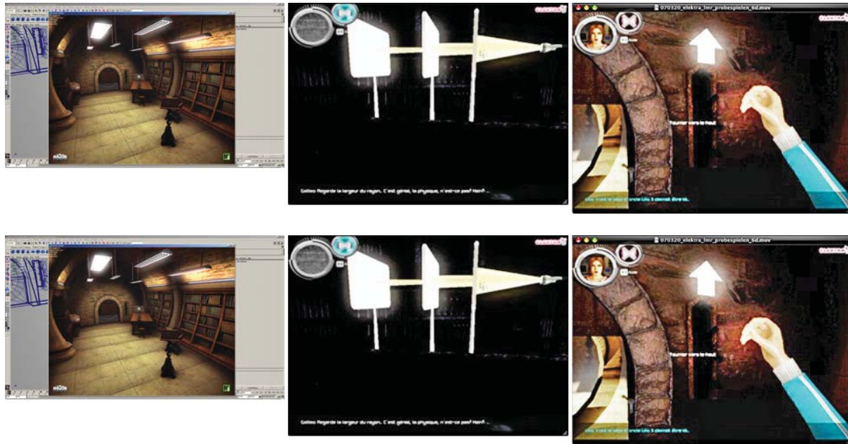
Figure 1. Conventional design of Elektra without support.

The second design condition (G_ES) is similar to the first in that no support is given. Rather, descriptions of the relevant learning concepts are presented in a separate hyperlinked textbook. The learners are made aware of the support device that is always available by a permanently visible button with a hyperlink to the textbook (see Figure 2).