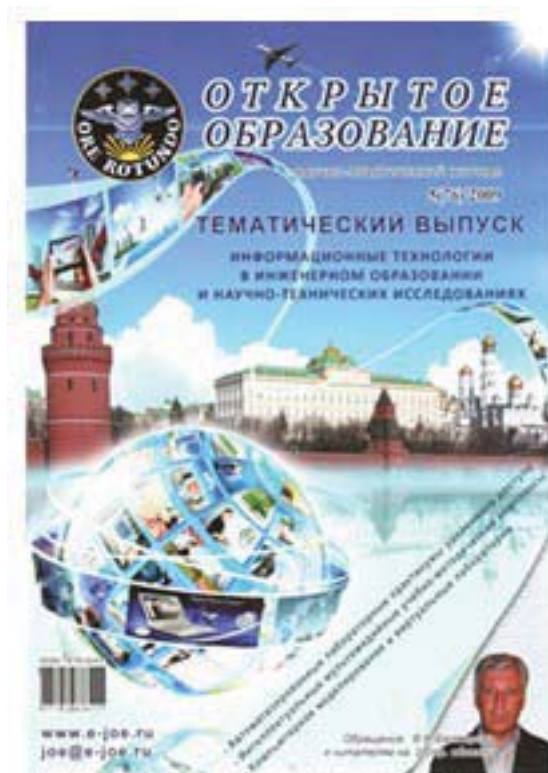
Figure 3. Journal cover of Open Education (2009).

Within the Russian literature the term distance education is similarly discussed but conceptually isolated from the older term correspondence education (cf. Ovsyannikov & Gustyr, 2001). This distinction is for example adopted by the Russian journal Open Education (Открытое образование), which can be regarded as equivalent to the prominent British journal Open Learning , yet the Russian version employs a greater focus on technological aspects of online distance education. Open Education was first released in 2002 and is published by MESI.