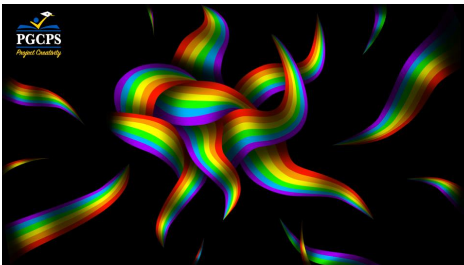
One art teacher designed this creative background for each iPad so they can be identified quickly as part of the program.

The PGCPS Fine Arts Office used ESSER funds to purchase several thousand iPad Pros with an Apple pencil and keyboard and newly updated iMacs. During the pandemic, students could not use Chromebooks to access Adobe Creative Cloud software from home. As a result, a request was made to use these new funds so that students could create art and