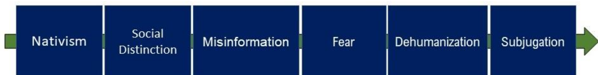
Figure 3. Demoralization Process

Demoralization is a “self-perceived incapacity to deal effectively with a specific stressful situation” and is “a combination of distress and subjective incompetence” (p. 308). 67 It is characterized by helplessness, hopelessness, resignation, 68 and loss of purpose and meaning in life. 69,70 Demoralization is linked to major depression, anxiety disorders, adjustment disorder, irritability, alexithymia (emotional numbness), type A behaviors, and grief. 68,69,71 Moreover, demoralized individuals are more likely to become confrontational and angry; 68,71 suffer from attachment disorders, have conduct problems, retreat from society, and commit suicide. 68,69,72 The demoralization process starts with nativism (see Figure 3). 17