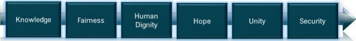
Figure 2. Social Change Process